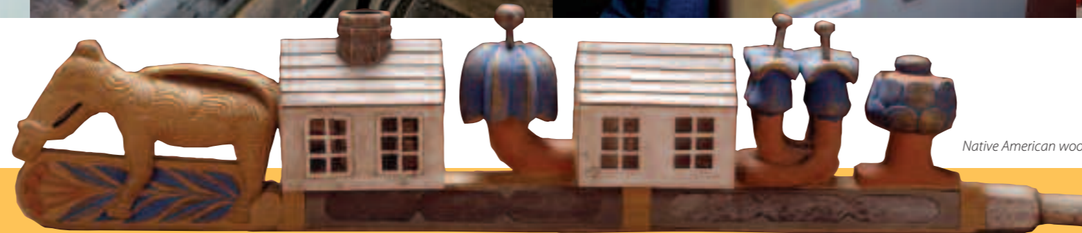
Native American wood pipe