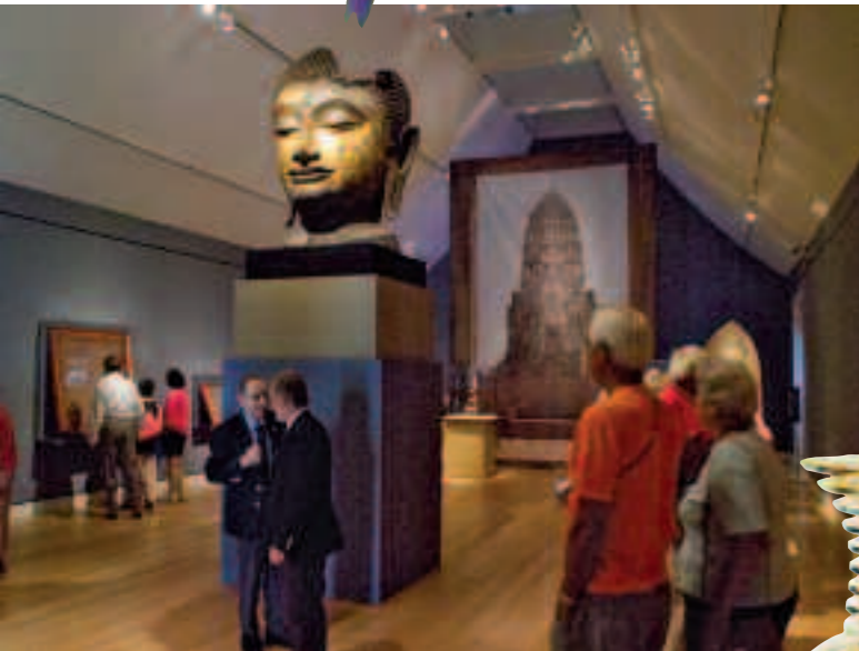
Enjoy a wide array of traveling exhibitions from major museums around the world. From contemporary art to photography to Asian art and culture, PEM brings some of the finest and most prestigious exhibitions to New England each year.

Visit Salem and the Peabody Essex Museum today, and make your New England experience truly unforgettable.