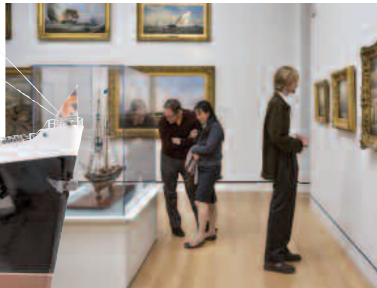
23-foot-long model of the RMS Queen Elizabeth.