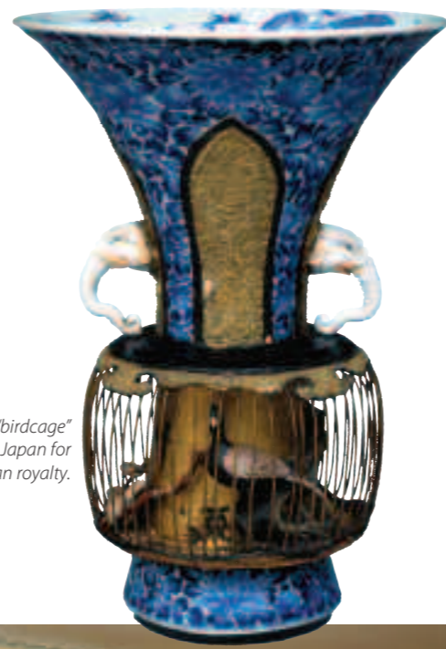
Early 18th-century "birdcage" vase made in Japan for European royalty.

Journey through New England's grand and storied past through the eyes of America's first global entrepreneurs. As patrons of the arts, they left behind an extraordinary cultural legacy that reflects the emerging power and status of a young nation. PEM's American art galleries feature exquisitely detailed New England decorative art, paintings, textiles, costumes and one of the finest collections of maritime art and culture in the country.