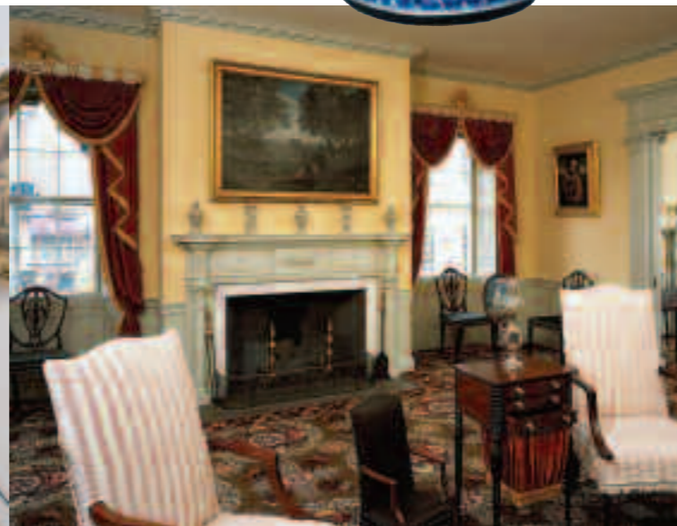
Explore the museum's Gardner-Pingree House, a National Historic Landmark built in 1804 – just one of the many historic houses on the museum campus.