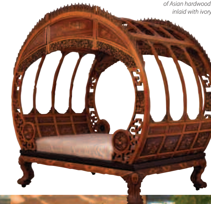
See the elaborately carved Chinese moon bed made of Asian hardwoods inlaid with ivory.

"One of the nation's top 10 art museums for kids" — Child magazine