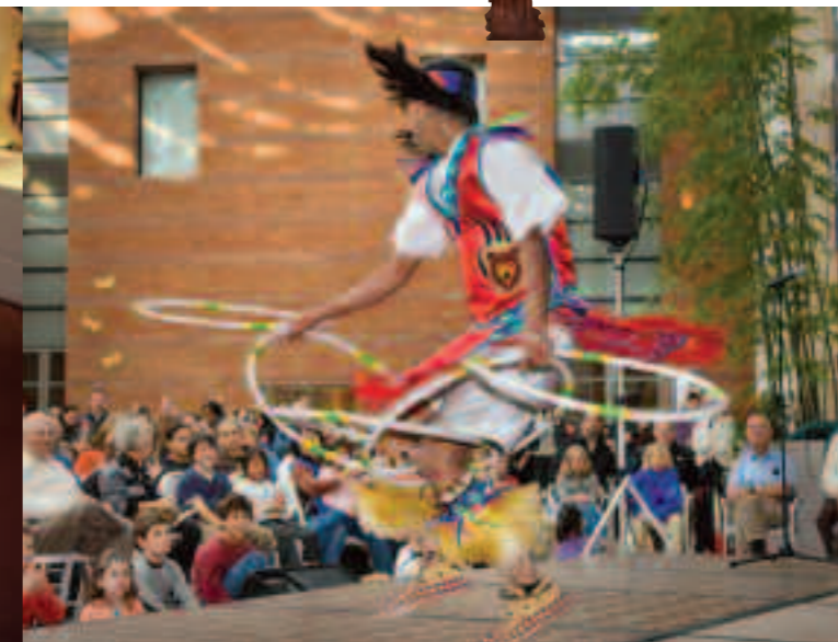
Take part in lively public programs offered throughout the year, many free with general admission. See artist demonstrations, live performances and concerts, or participate in hands-on workshops and gallery tours.