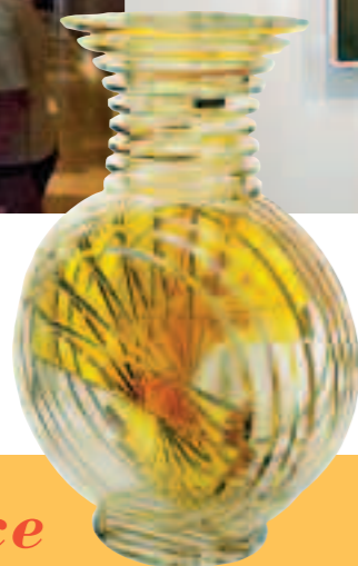
Contemporary American glass sculpture