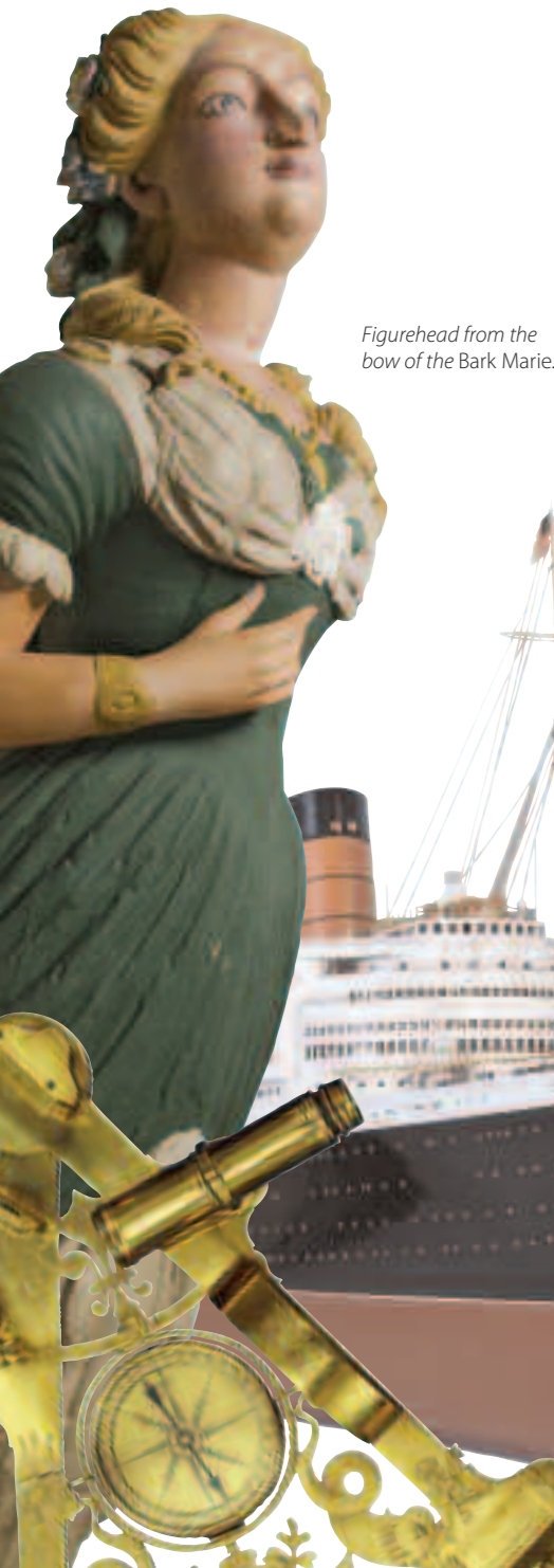
Figurehead from the bow of the Bark Marie.

Journey through New England's grand and storied past through the eyes of America's first global entrepreneurs. As patrons of the arts, they left behind an extraordinary cultural legacy that reflects the emerging power and status of a young nation. PEM's American art galleries feature exquisitely detailed New England decorative art, paintings, textiles, costumes and one of the finest collections of maritime art and culture in the country.